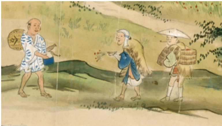
Farmer showing benibana to a merchant

Many scenes for trading are shown between the process ④ 'Petals Plucking' and ⑤ Rinsing. The farmers couple of benibana cultivator hand the plucked petals at the field lane. The figure who gets them looks a salesclerk with a straw hat lettered his shop mark on it. Such a man appears in the village to get the best information of benibana harvest as soon as possible. At the harvest, villages were prosperous, because many merchants and salesclerks visited there.