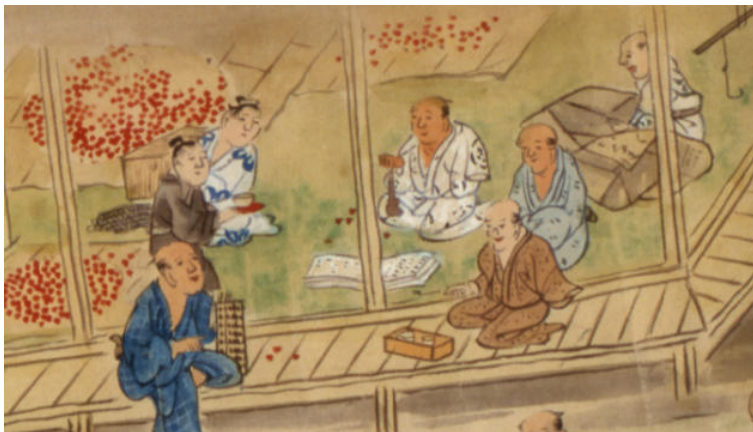
Last trading for shipping

In the scroll, a figure is drawn holding a trading note under his arms in a traveler's style. At the other side of a river, a trader is smoking with a pipe, looking a busy working beside a brown and a white horse.