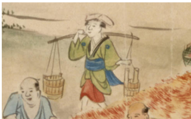
Woman with pails

This tells that, at this season, various people including ladies join the farmers. They happen to help the busy working people in the villages. Or they intend to earn money in a daily employment. “Yamagata-zakki” (『山形雑記』) reports that there were so many daily employed women at that season. Anyhow, we confirm the working scenes in every village.