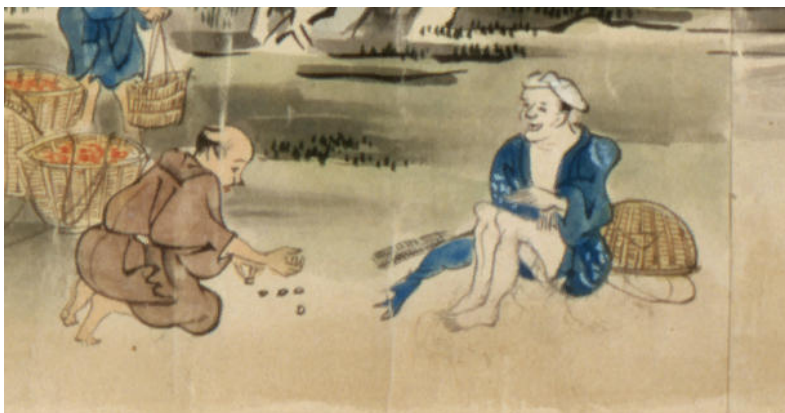
Negotiation for price?

The trader negotiate with the 'sanbe' and delivers a cash. Some of money are scattered on the ground. And also at the left side, three men of a native village are standing around the trader, who can not get a suitable negotiation. The cash note is thrown away from him. Three men are smoking, looking with enough satisfaction. At the scene of packaging, the negotiation done in a fine merchant yard seems the last one to send them to Kyoto.