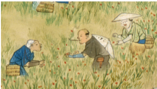
Petal's plucking with a pipe

At the scene of ④ of “Flowers (Petals) Plucking”, ten of men and women are working in the field. A man at the center is smoking a pipe in his mouth, and smiling peacefully. A woman at the right beside of him is working as he does. “Plucking” is the work that must be free from flowers thistles in a dew time of early morning. Actually, farmers do not smoke during the work, so the picture shows something left. But “a woman peddler” would often come to the field to sell some sweets and a fire for smoking. Perhaps, some men had smoking even during the work.