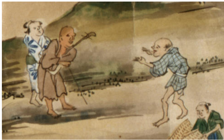
Blind strolling players

In the process of ⑫ “Drying Petals”, a man is standing by with a stick, being held by a woman and he is cherishing a shamisen in his breast. But they may be a blind couple-blind itinerant people. Then a man is approaching and calling. The blind man stands his fingers to show a fare. The man approaching was told the fare for playing the instrument. It may be free time in busy working. This scene is one of the village scenes of busy benibana season.