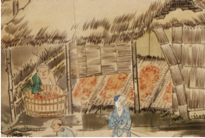
Fermentation of Petals / Kneading of Petals

In “The Benibana Folding Screen” such a scene as this is just painted up.