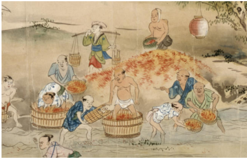
Rinse of Petals / Crumpling of Petals