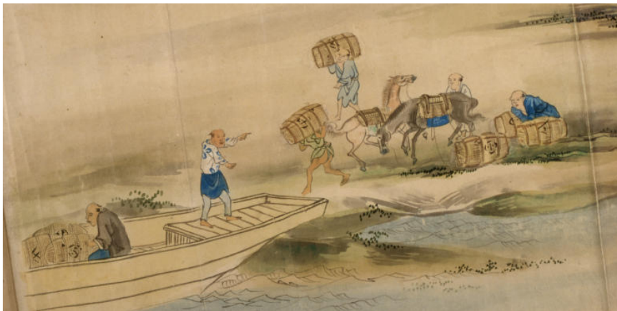
Convey by Land and Shipment

Except the screen, ‘The Benibana Picturescroll’ tells that the painter did not make much of shipping scenes.