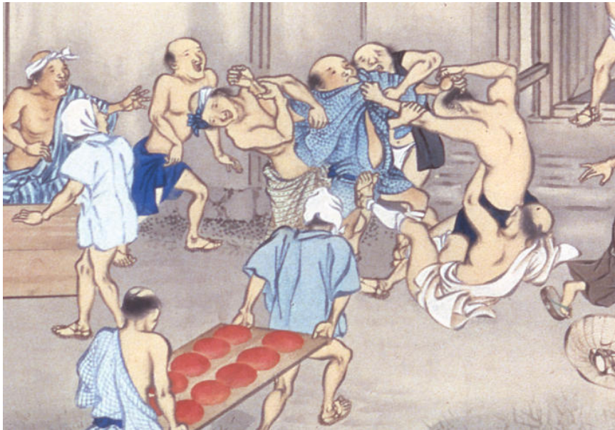
Scene of violence and confusion painted by Kazan Yokoyama in “The Benibana Folding Screen”