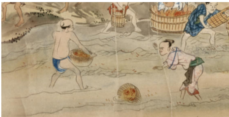
Rinsing of Petals

Here, the crumpled petals are removed to a basket to get rid of a yellow pigment called Kikejiru (黄気汁). Generally speaking, as the Kikejiru is rinsing off, the quality of beni (紅) becomes refined. The better quality of beni is made by rain or dew in the night and if not, more transaction is needed to rinse the petals longer. In the scroll, a man is bringing a basket nakedly with a loincloth. It is not certain that the work finished or not. Beside him, a woman is working in a river with an apron and a sash for holding up tucked sleeves. But she failed to rinse petals in a basket from which the petals were dispersed in the river. Her face and a gesture with a disappointed expression look funny. The painter never fails to catch a minute gesture which happens in daily lives.