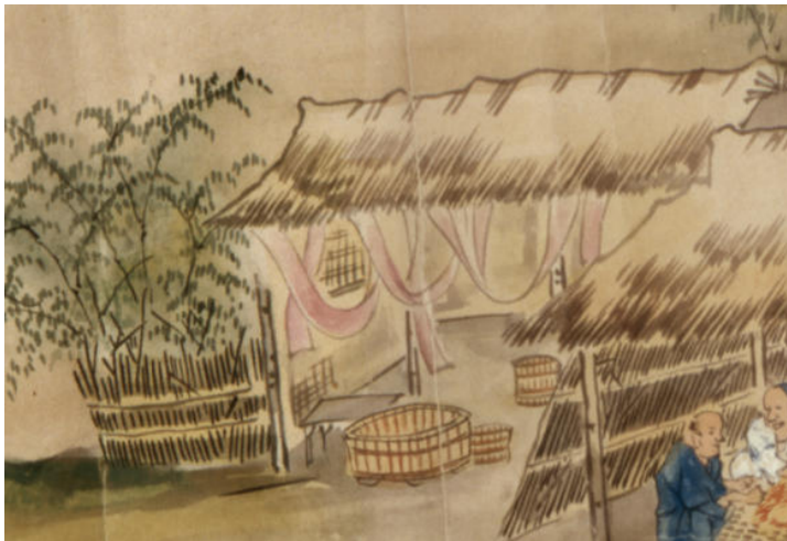
Dyed cotton (cloth hanging above a pail)

On the other hand, the screen shows that three women were dyeing bending on the pail, and the dyed cloth was drawn on a wash-line pole. But the cloth was dyed in clear red, which went well with the reality of that period. People's clothes dyed with benibana pigment were more simple and slightly rouged. The painter of "The Benibana Picturescroll" seems to depict the situation more realistic.