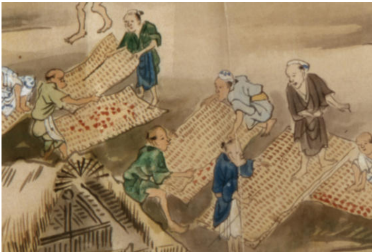
Treading Petals / Drying Petals

In the scroll, a sunny space is kept in front of the cottage, and a series of the work is done on the straw mats. And the work needed a wide space of a big farmers' yard.