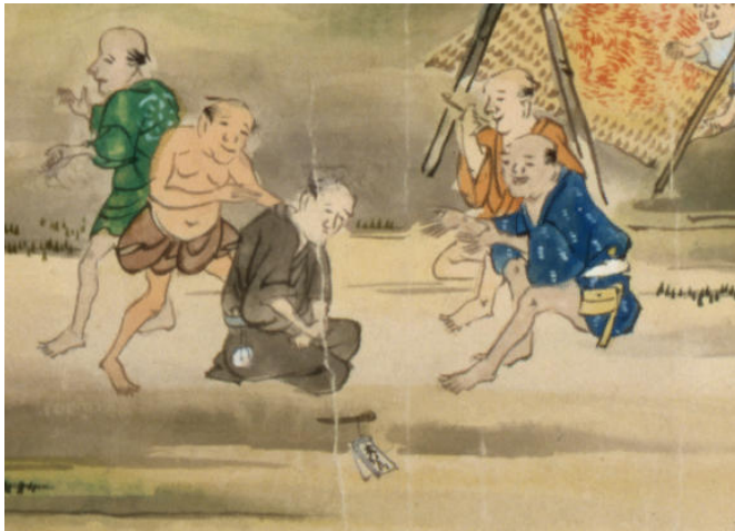
Merchant at a loss in negotiation

Such trading scenes as these mean, showing its prosperous dealing, that there are various styled ways for benibana trading. Actually, they had the market at Nanokamachi (七日町) and Tokamachi (十日町) in Yamagata and the goods were competed for trading. Many dramas seem to be done in trading and tried to fathom the other intention.