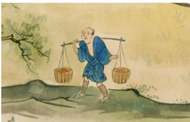
Sanbe (collector) with baggages

At the left, a man is drawn with a scale basket on the shoulder. He is called 'sanbe' (サンベ) who collects benibana directly from the cutivators. He looks bringing goods, but slight motion is drawn in the painting.