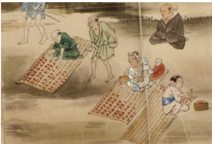
Arranging of Flowers

This process is to arrange the round benimochi in order on straw mats. Usually they are put 13 cakes horizontally and 26 cakes vertically. At the space in front of the cottages five of men and women were sitting to work. A mother looks busy, laying her baby backside. Maybe this scene tries to draw farmers being fully occupied the work.