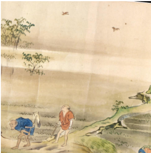
Seasonal two skylarks

Two brown skylarks are drawn in the sky of the process ① 'Tilling the field' and ② 'Sowing seeds'. Though two creatures are easily ignored, the sky is a symbol of spring. Two birds seem to be a couple. A farmer with a hoe looking up them is clearly painted. The painter seems to tell the cultivating benibana begins in spring.