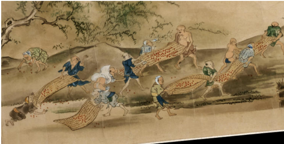
Hasty sheltering work

make benimochi, fighting against the weather.