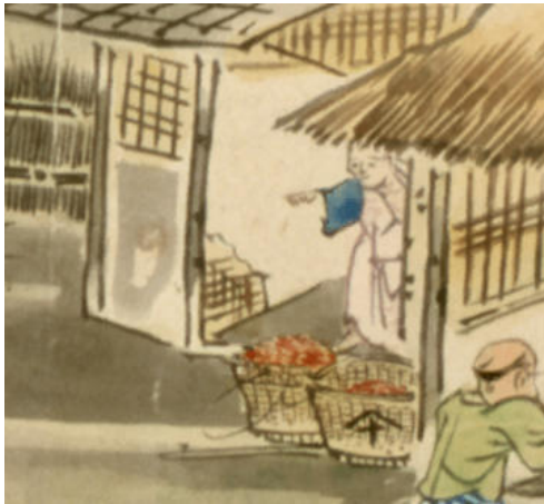
Shop's trademark (今) ヤマジュウ