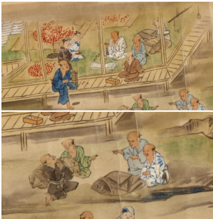
Packaging Petal Cakes

Anyhow, a brown oiled paper of package is seen indoors and other three outdoors. The package has too triangular tips at the both side. Some doubt is occurred what they are. And more at the next scene it suddenly changes to round-shaped. It seems that the package is covered with straw mats.