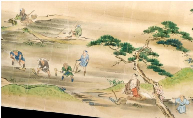
Cultivating of Land