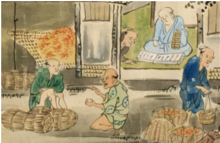
Merchant with an abacus in his hand

And the bottom of left side, a merchant is calculating something, opening a note and pondering with an abacus in his hand. Beside him, a clerk is holding his head at a loss. On the other hand, out of the garden, a 'sanbe' and a good costumed trader who seems to come from other country are talking about the price of goods.