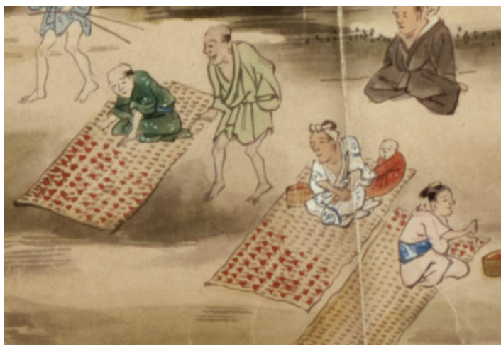
Shape of benimochi (triangle)

In this report above, 'in Mogami area' means benimochi in Murayama is small and a coin-shaped. But, here, some question occurs. Look at the shape of benimochi in the scroll. The shape there doesn't look like a coin-round or oval. They are really triangular or rhombic. Then some doubt occurs that the scroll was painted in Aizu. According to "Aizu Agricultural Report," (『会津農書』) benibana was also cultivated in Aizu area. This problem must be pursued in the viewpoint of a comparative cultural history. In the report this doubt is stopped only to point it out.