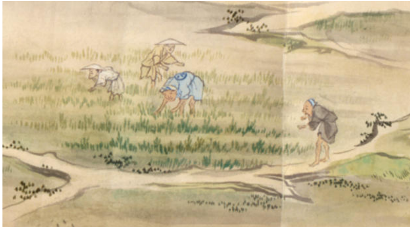
Weeding and Eliminating

body stooping. An old woman is shouting on the field lane and one of the farmers seems to answer her with his face up. Such a minute drawing is also shown to draw other three men in the upward part.